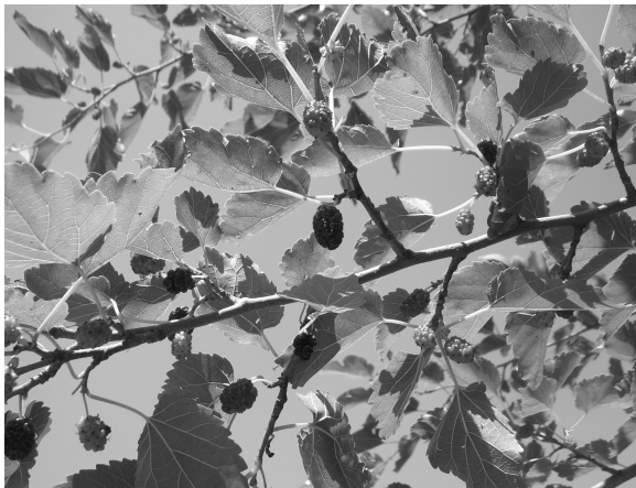
Mulberry tree with some dark ripe berries. The others will be ready in a week or so.

feel like using the sheet method would be unfair. Instead, for that particular tree, I harvest the berries individually