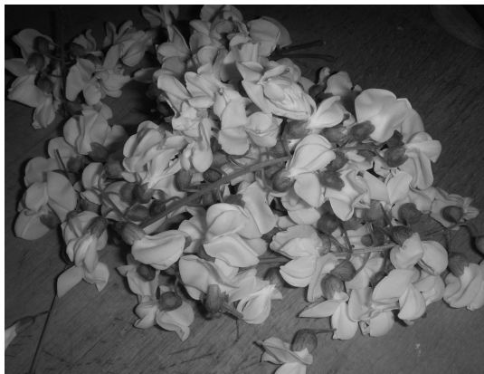
Black locust flowers, plucked and ready for eating.

Start by smelling them. A thick, jasmine-like scent fills you up, with a taste that is just as good. I pluck a whole bunch and then strip off the flowers with my teeth. Other edible flowers are at best color additions to salads, but these black locust flowers are hearty, crunchy, and sweet, and make a great snack in the field or at the table back home. If you want an impressive and unique dessert using fresh specimens, try black locust fritters. Using whole-wheat flour ought to partially offset the fact that these are best when fried in lots of oil.