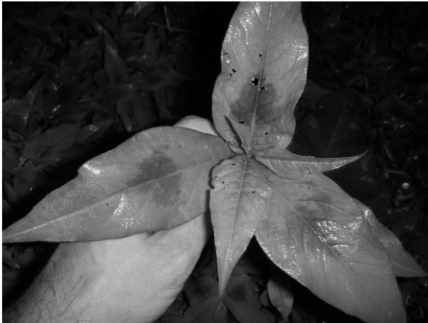
Lady's thumb after some rain, when the dark splotches in the middle of each leaf are most obvious.

When picking lady's thumb, just pluck individual leaves since the stems are a bit tough. For lamb's quarters, on the other hand, you can grab a bunch of the leaves (from the top of the plant, leaving the rest of the plant to grow)