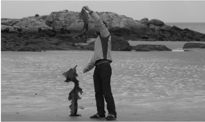
Cutting a piece of kelp to take home. Seaweed extends the foraging season into winter, when this picture was taken.

—the blackish seaweed that attaches to rocks and is covered in air bladders that cause it to float to the surface during high tide—is edible but not particularly good. If you want to eat it, I recommend drying it and smashing it up, or putting a little bit in a blender for a soup.