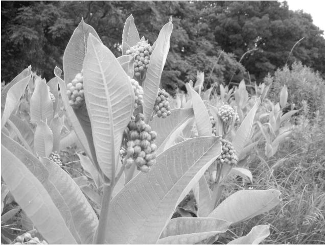
Milkweed at the "broccoli" stage, right before the flowers emerge. These flower buds can be boiled and eaten.

I do not usually bother with the flowers. If you care to try some, first dip the flower bunches in boiling water for about a minute, then run them under cold water and add them to a salad.