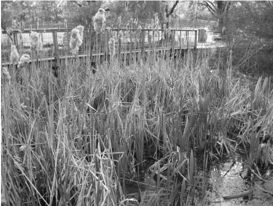
Cattails grow in marshy areas. Urban marshy areas are likely to be polluted so not great cattail foraging spots.

cores can be obtained by cutting the plant at the base or firmly yanking the inner leaves straight upward (bend at the knees). The core is less stringy than the outer leaves. You can try it raw, but it leaves a scratchiness in my throat like evening primrose roots do. Better to chop it small and mix it into a soup. To eat the next part, the brown corndog-looking thing at the top that is the most recognizable part of the cattail, we have to wait for another month of summer to pass. When the plants reach about five feet tall, keep an eye out for a swelling under the leaves near the top of the plant.