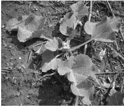
Early leaf growth of a burdock plant, ready for digging.

I've been wondering what would make a good shrimp substitute for the classic party hors d'oeuvre. The evening primrose root fits the bill: white and pink and crunchy, and mild enough to let the cocktail sauce (the real force behind shrimp cocktail) shine through.