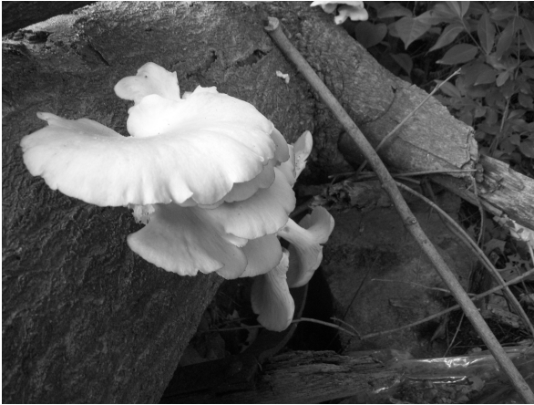
Some great looking oyster mushrooms growing in their usual habitat, on fallen trees.

The puffball is another edible mushroom that is very easy to identify. There are different types of puffballs, some growing into a very large white ball, and others staying smaller than a golf ball. The rule is: if a puffball is white all the way through and soft, like a marshmallow, it is edible. Some puffballs found in the woods are purplish black inside, and they should definitely not be eaten. Some young puffballs are white but hard—these should also be avoided because they are poisonous. Slice puffballs through to