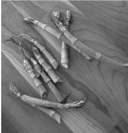
Japanese knotweed shoots. Note the bamboo-like sectioning. The knotweed is hollow everywhere except at these segments.

Pods provide the only home for monarch butterfly eggs. The fibers from the pods were also gathered and used as fill for life jackets in World War II. Thomas Edison tried to cultivate milkweed as a source for rubber, but the amount of latex in the plants was too small for him to be successful.