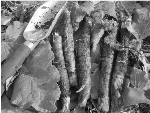
Burdock roots, the spade that dug them, a burdock leaf, and some burdock burrs.

but it is a good way to learn the plant and mark a good spot to look in early spring for little green carrot tops emerging. Wild carrots are white and not as big as their domesticated counterparts, but sometimes you can get lucky and find some slightly hefty ones. If the smell is not strongly reminiscent of carrot and the tops don't look exactly like a smaller version of the tops of store-bought carrots, there is the danger that the plant might be poison hemlock. So if you are uncertain, it's better to avoid this plant.