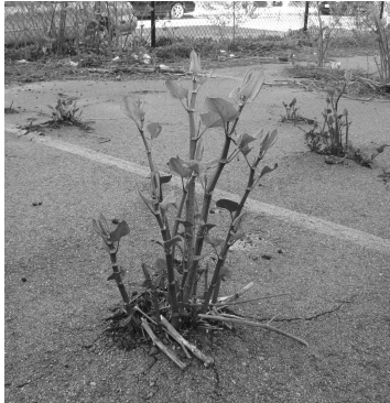
Japanese knotweed will grow anywhere. Here are some patches breaking through pavement of an abandoned lot.

we realized it was all over the place. The idea of eradicating knotweed is funny—like trying to eradicate rats in New York City.