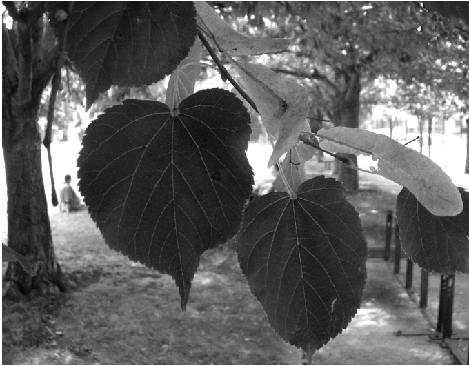
Characteristic lopsided heart shape of the linden leaf. Linden bracts, the lighter green tongue-shaped leaves, are also shown.

In early spring when the linden leaves first appear, there is a red tinge to the bud. You can eat the whole bud—just grab it and pop it in, since there are no poisonous parts to be careful to avoid. For the next few weeks, as long as the leaves are not too tough, I keep eating them. They never get poisonous, just too tough.