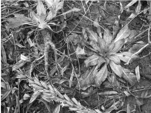
Evening primrose shown three ways: uprooted, still in the ground, and a stalk from the previous year.

evening primrose, get out your trowel and carefully dig it up. If it has a decent-size white root, with a slight red tinge near the leaves, you have probably found the plant. Sometimes the root will be skimpy and not worth collecting, but a few weeks of experience squeezing at the base of the leaves to size it up will make you good at predicting which ones will be worthwhile.