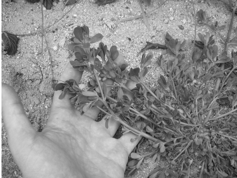
Purslane growing in some compacted, sandy soil. This entire plant can be plucked and eaten raw or cooked.

A walk in the summertime through city streets, with nothing but a few plastic grocery bags stuffed in your pockets, can yield a meal that embraces the randomness of foraging. Maybe you take a longer route from point A to point B, and as a result you come across a big healthy patch of lamb's quarters; or you go through a little park and find a small stand of cattails or an abandoned garden plot full of purslane. I enjoy these foraging surprises, and I like not knowing what will become the centerpiece of my next meal. When I have time, I try to take the long way home.