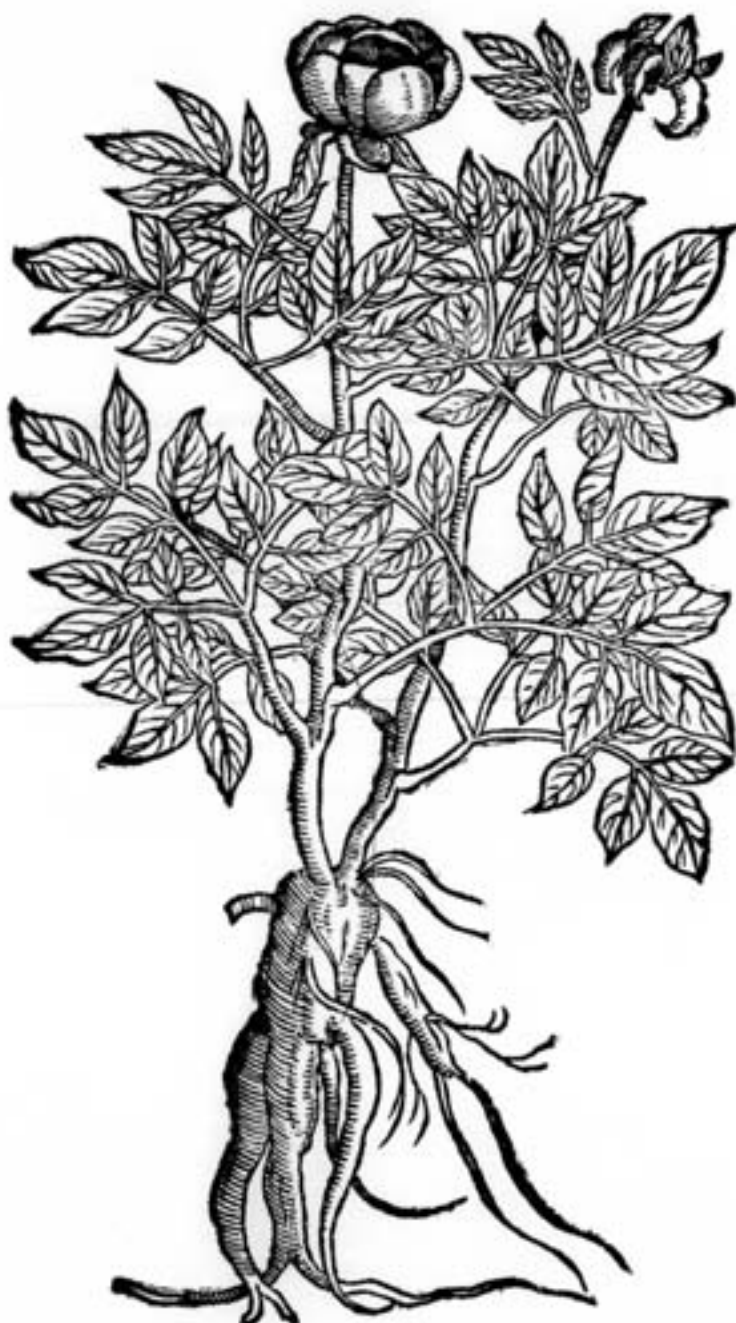
γ Paeonias. Male Peonie.