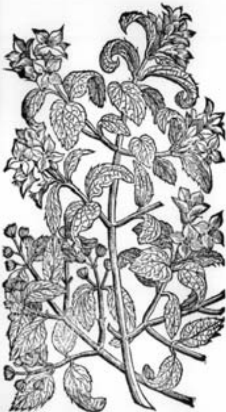
1 Syringa alba , White Pipe.