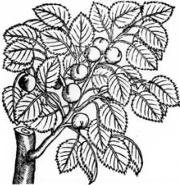
Malus Armeniaca. The Appetok tree.

Whitlow Grass (23) Draba verna L. Native in Europe, Asia and North Africa. Long common as a garden weed.